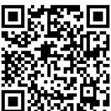
Presurvey QR Code