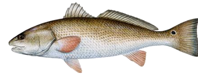
Redfish (Red Drum)